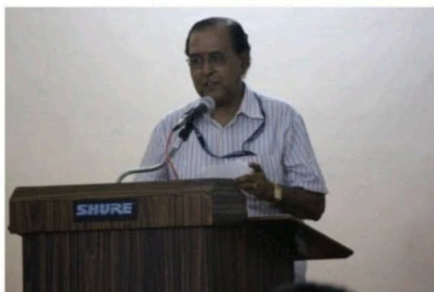
Talk by Chief Guest